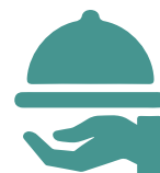
TABLE SERVICE ONLY

(Chocolate/Strawberry/Caramel/Banana/Vanilla)